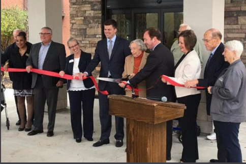
Kingswood Senior Living Community Addition Ribbon Cutting.