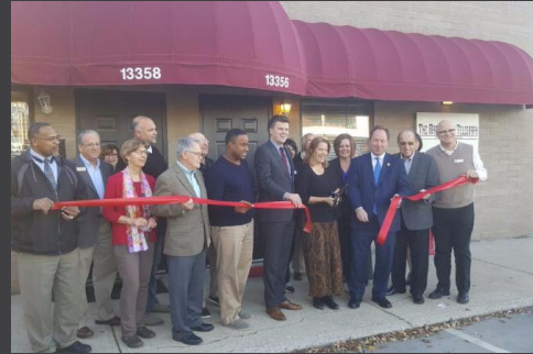
Martin City Telegraph Office Ribbon Cutting.