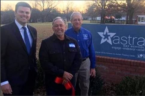
Ribbon Cutting for Astra Day School, serving children with autism in South KC.