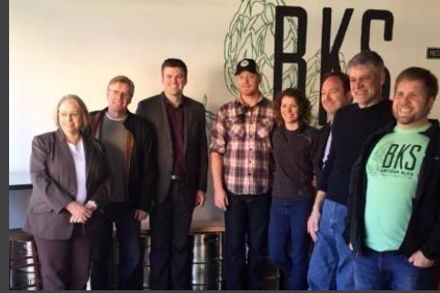
BKS Artisan Ales Grand Opening.