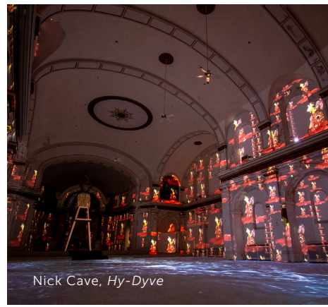
Nick Cave, Hy-Dyve

“ For many of our Kansas Citians it was the first time that they were seeing this complex format, discovering different parts of the city and connecting through the art.”