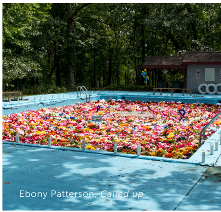
Ebony Patterson, Called up