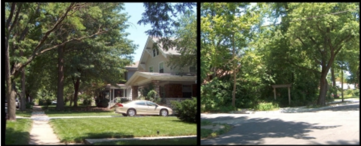
Recommended Maintaining the Open Relationship

Planting trees that would obscure the majority of the front facade from public view is discouraged and would require the review of the Commission. When planting trees, remember that it is important to maintain the “open” relationship of the building to the street. While a tree may be small when planted, over time it can obscure the front of a building and alter the character of district.